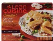
FROZEN FOOD PACKAGING